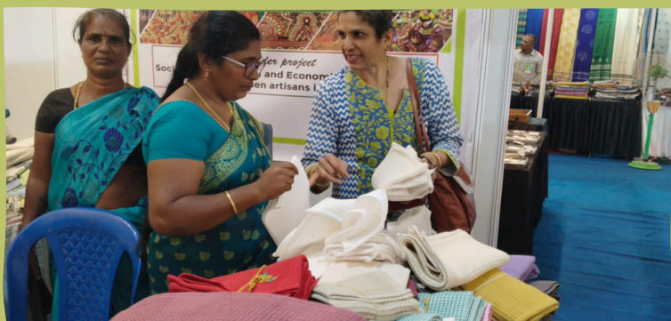
Exhibition Bangalore, Karnataka