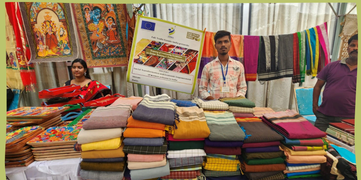
Regional Fair Visakhapatnam, Andhra Pradesh