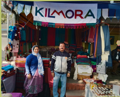
Dastkar Winter Exhibition, New Delhi