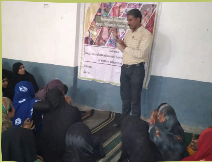
Human Welfare Association

11 Community Level Workshops in the North Region were conducted in New Delhi, Uttar Pradesh, and Uttarakhand.