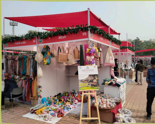
German market Exhibition Jawaharlal Nehru Stadium, New Delhi

8 Trade Fairs were organized from October to December 2023