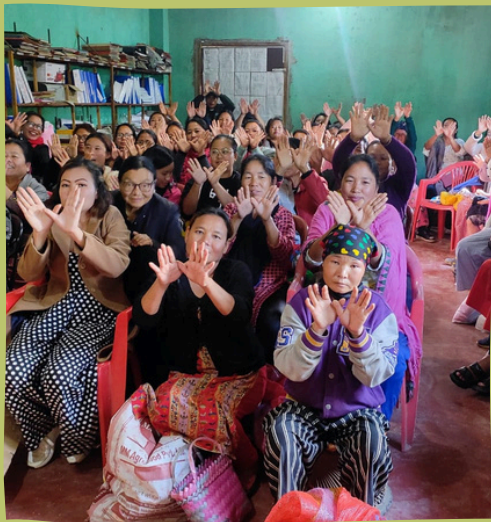
Weaker Section Development Council

12 Community Level Workshops in the East Region were conducted in West Bengal and Assam.