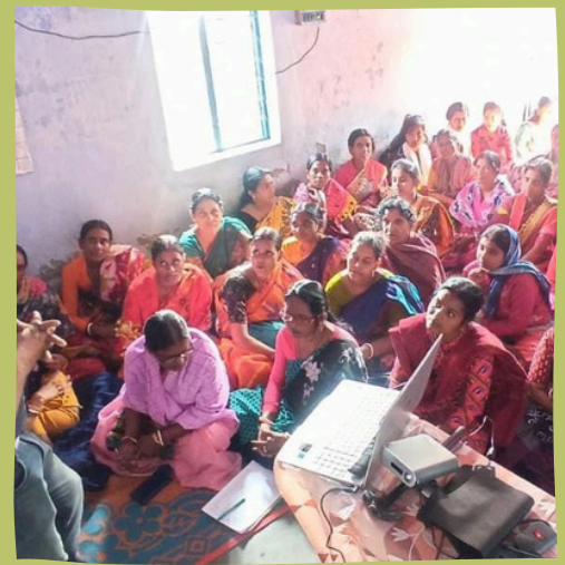
A Head Initiatives