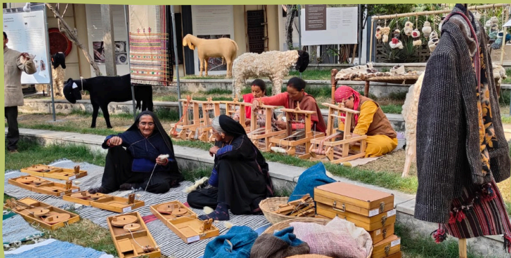
Desi Oon Festival, Mandi House, New Delhi