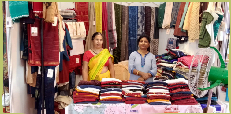
Exhibition, Chennai, Tamil Nadu