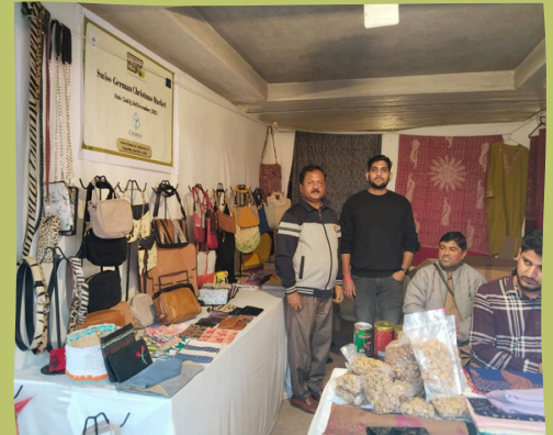
Swiss German Christmas Market Embassy of Switzerland, New Delhi